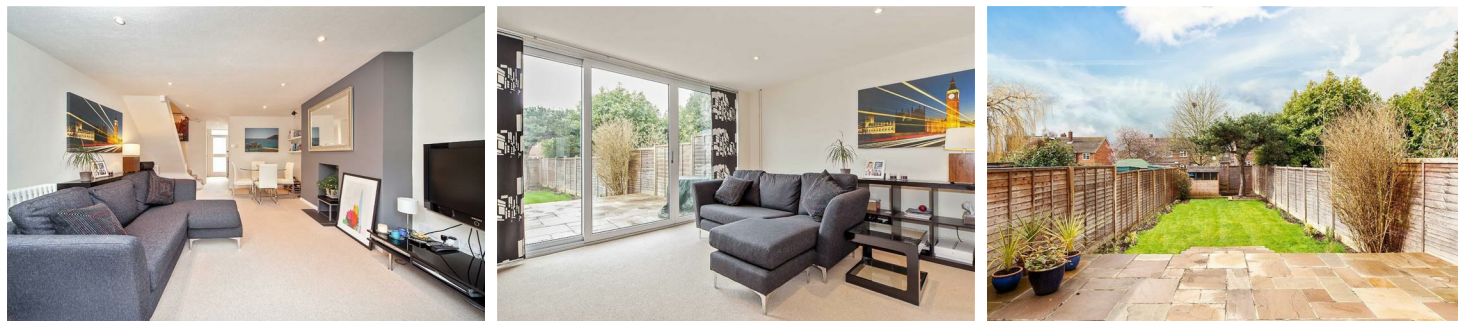
Ground Floor Approx. 38.9 sq. metres (418.4 sq. feet)

A very modern and fully refurbished two double bedroom family home situated in a popular location. The property benefits from well planned accommodation, lounge/diner, recently fitted kitchen, study area, utility room, two double bedrooms, family bathroom, gas central heating, double glazing, front and rear garden and with own private driveway.